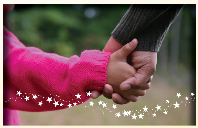
POST ADOPTION RESOURCE CENTERS

Post Adopt Resource Centers (PARC) are here to support you through the life-long rewarding journey of adoption. PARC is contracted by MDHHS to provide community-based services to adoptive families residing in Wayne, Oakland and Macomb Counties.